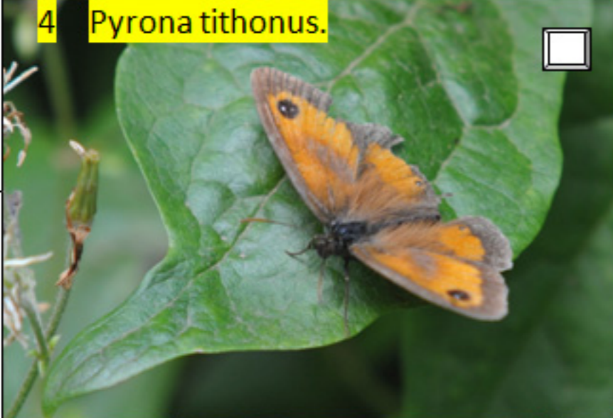
4 Pyrona tithonus.