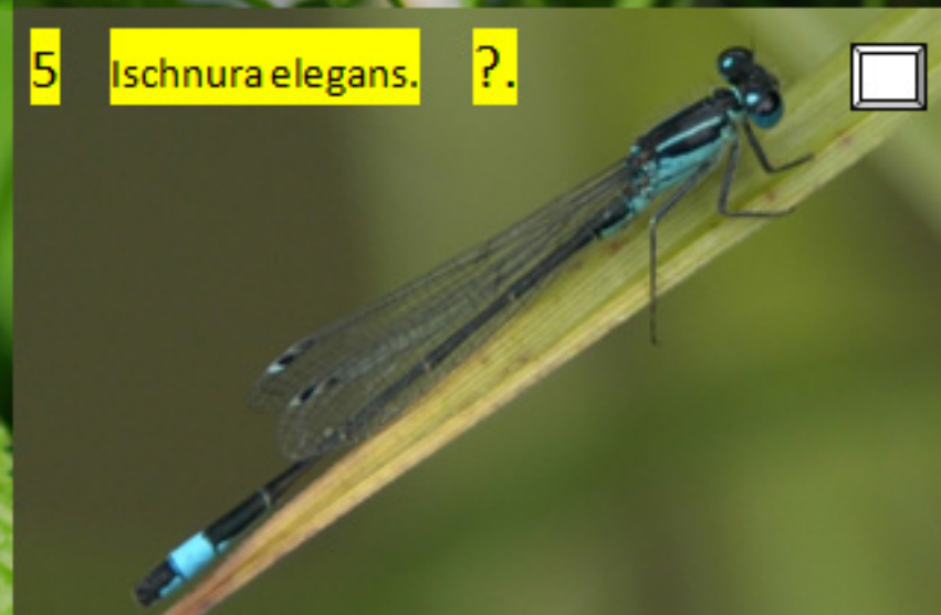
Ischnura elegans. ?.