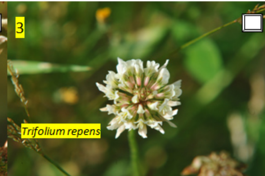
3 Trifolium repens