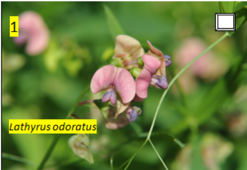
1 Lathyrus odoratus