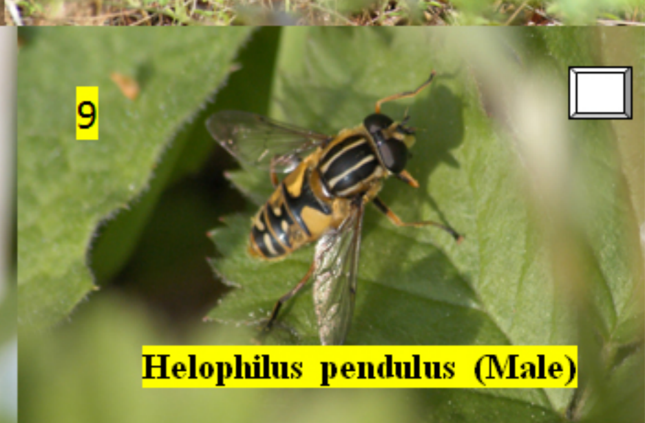
Helophilus pendulus (Male)