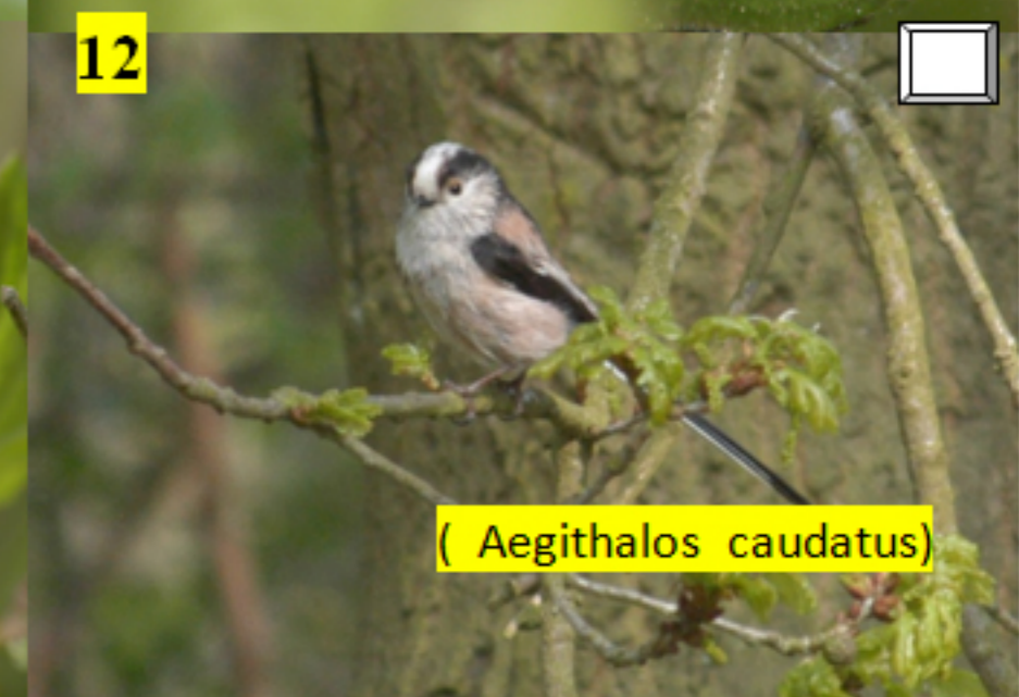
( Aegithalos caudatus)